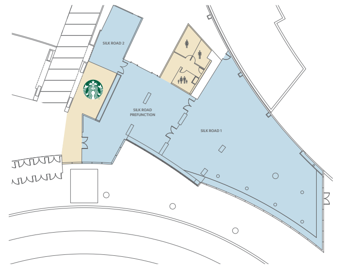
MEETINGS SPACE 2