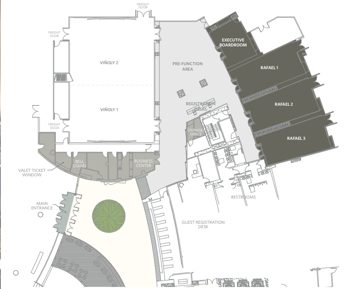
MEETINGS SPACE 1